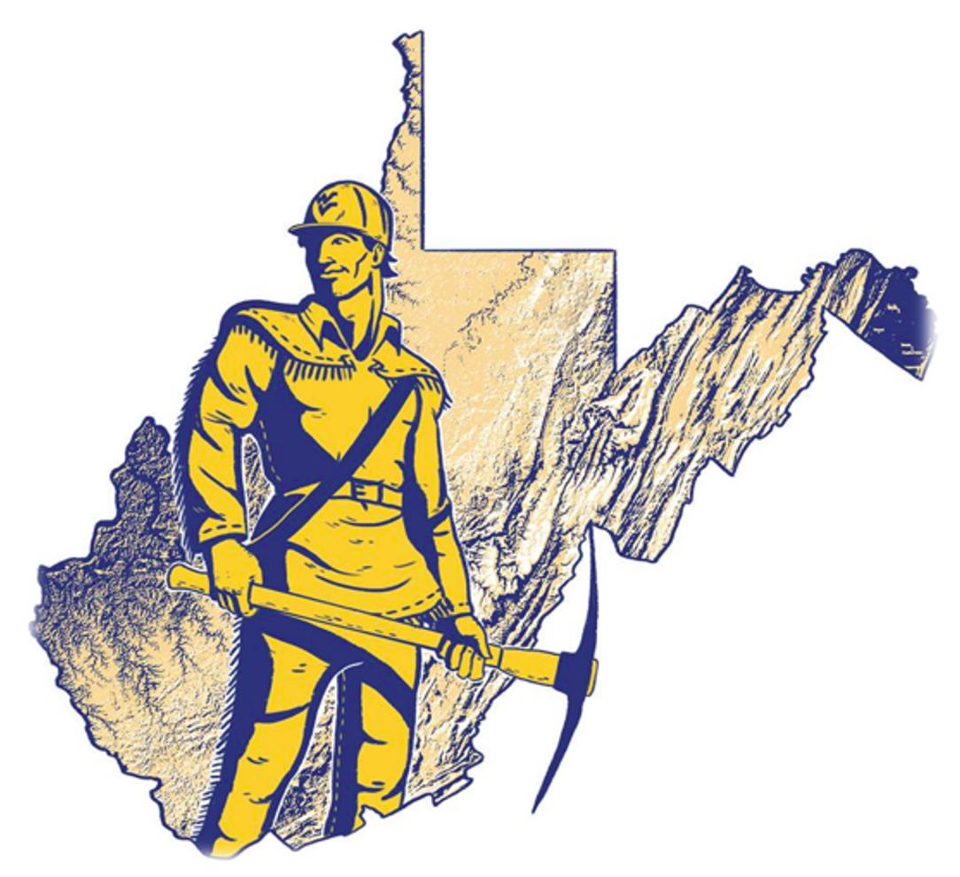
Society for Mining, Metallurgy, and Exploration